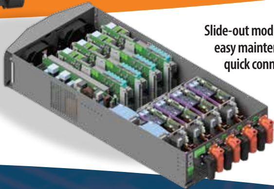
Slide-out modules for easy maintenance with quick connectors at back.